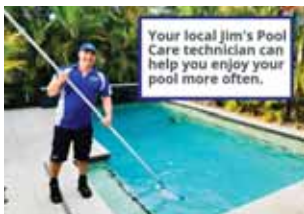
Call us about tailoring a regular service program for your pool

Your pool is an important asset and we can help you ensure that it sparkles and is always safe to swim in. From a one off call out to our regular service program we would love to help.