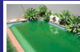
From Green to Clean

Then give us a call and we can provide you a green pool treatment quote to turn it from GREEN to CLEAN. You do not have to drain your pool so we can help save you money and get your pool sparkling sooner rather than later. This also applies to brown, muddy or black pools.