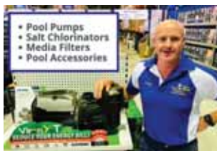
Equipment trouble shooting and onsite repairs

Having troubles with your pool equipment? We provide advice on how to set up your pool correctly. We will recommend the appropriate equipment for your pool and suggest options based on price, quality and warranties.