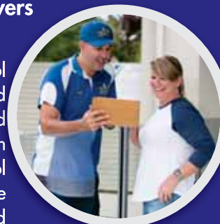
Book a one on one pool training session today

Whether you are a new pool owner or an experienced hand we can come out onsite and provide you a training session on how to maintain your pool and setup your equipment. We will give you all the hints and tips so book a training session today.